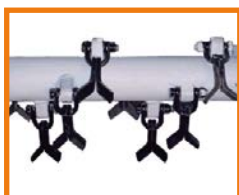
Multipurpose knives for herbs and shrubs max Ø 3 cm. ROTOR A

The hydraulic mulching head M3 is designed with a strong and reliable structure and can easily fit all types of excavators. It is manufactured in different models, depending on the use and size of the excavator and is supplied equipped with cast iron reversible hydraulic motor (hydraulic motor piston for excavators from 7 t), height-adjustable leveling roller, anti-cavitation valve.