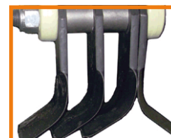
Slice knives for herbs, reeds and bushes max Ø 6 cm. ROTOR F