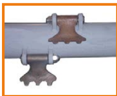
Heavy bat for vine shoots, bushes, reeds and shrubs max 8 cm. ROTOR G