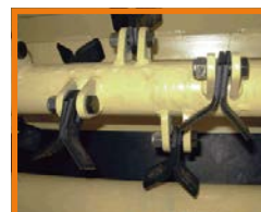
Lightweight knives for herbs and vine shoots max Ø 1 cm. ROTOR H