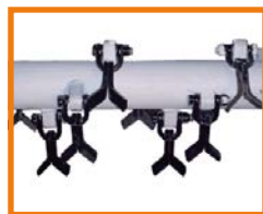
Multipurpose knives for herbs and shrubs max Ø 2 cm. ROTOR O