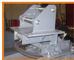
Floating balancer on request.